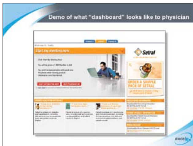
Aptilon's AxcelRx Live video detailing platform offers physicians a way to speak with sales reps at the most convenient time for them.